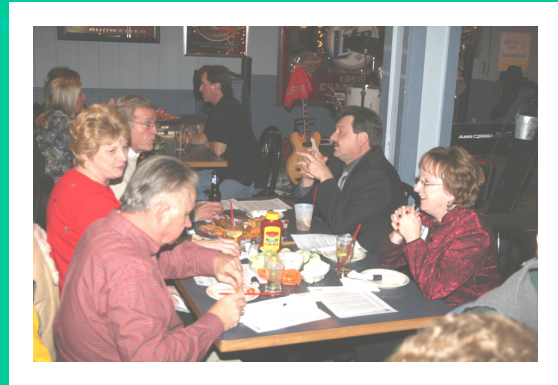
Guests enjoying last year's Networking Mixer